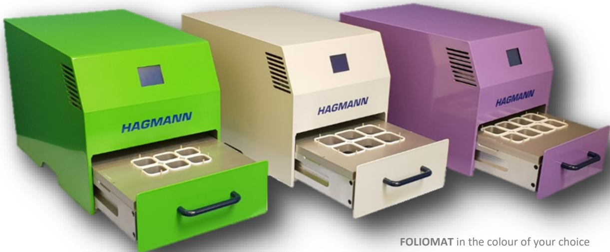
FOLIOMAT in the colour of your choice