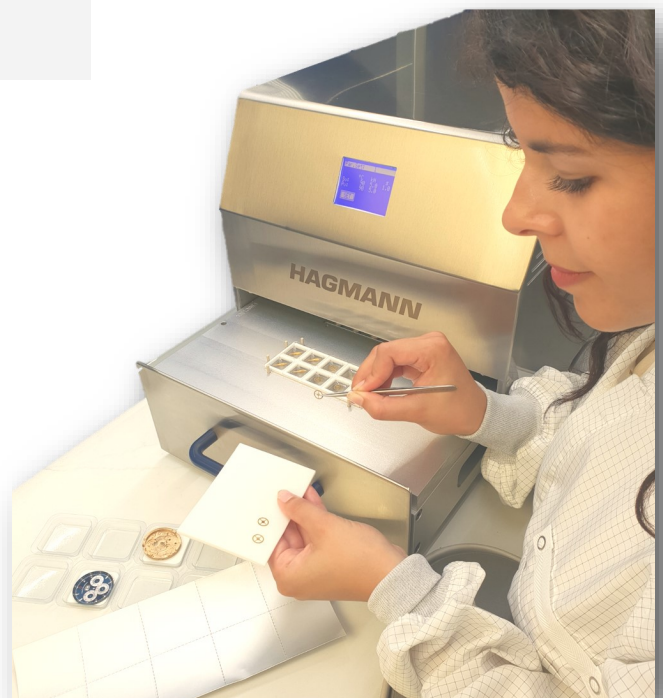
FOLIOMAT classic in INOX