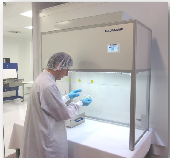
HAG-TTLF: Table Top Laminar Flow with integrated sealing machine as a compact cleanroom packaging system