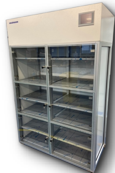
Laminar Flow storage cabinet offers permanent protection against dust and particles