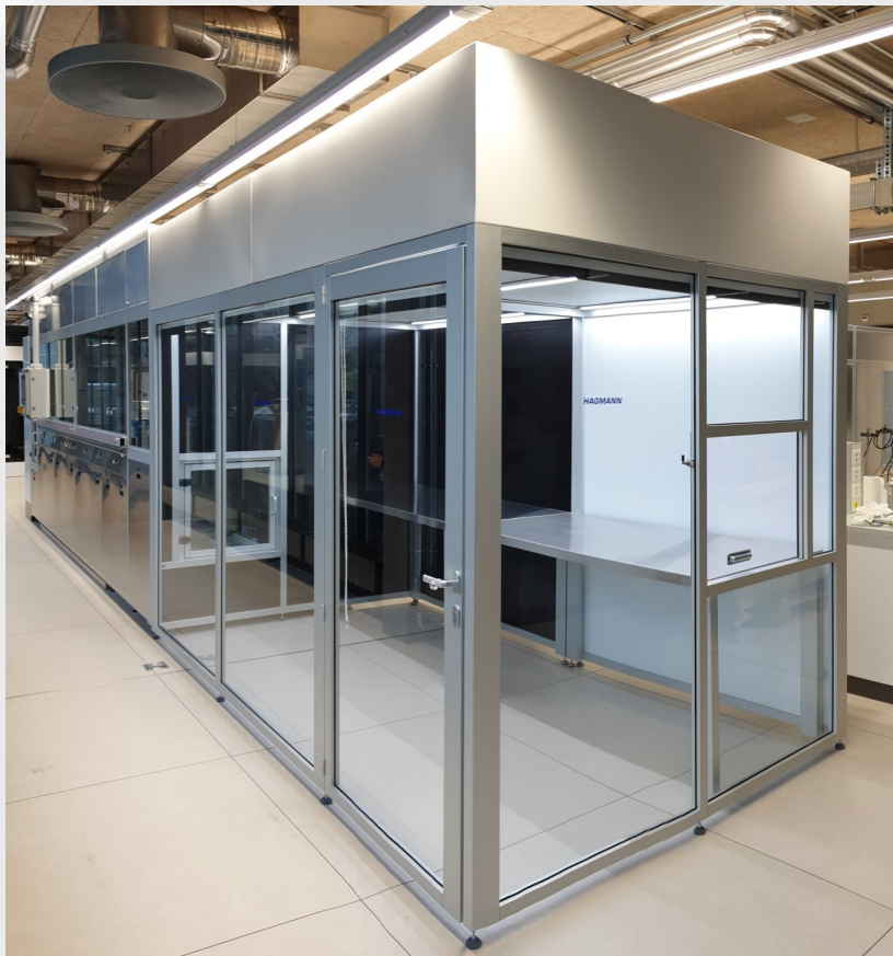
HAG-ECLF: Easy Cell Laminar Flow