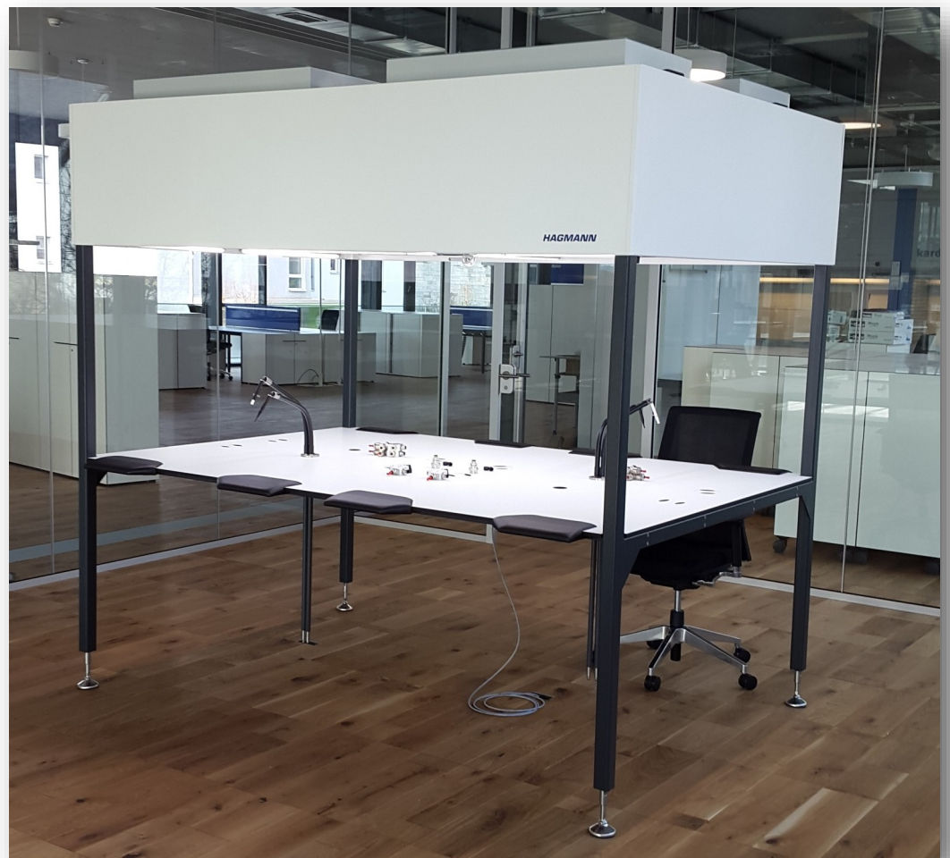
HAG-SSLF: Self Supporting Laminar Flow with integrated work table