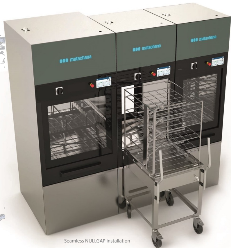
Seamless NULLGAP installation

INNOVATION FLEXIBILITÄT BEDIENERFREUNDLICH EFFIZIENZ TECHNOLOGIE KONNEKTIVITÄT SICHERHEIT NACHHALTIGKEIT