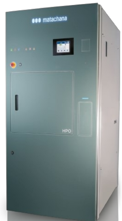
h2o2 plasma low-temperature sterilizer

INNOVATION FLEXIBILITÄT BEDIENERFREUNDLICH EFFIZIENZ TECHNOLOGIE KONNEKTIVITÄT SICHERHEIT NACHHALTIGKEIT